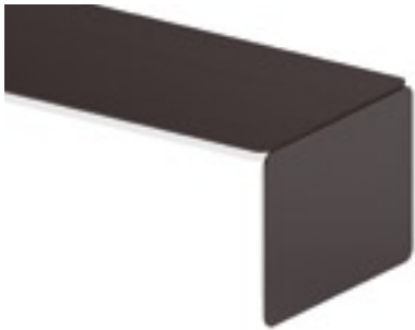
CB Beech Colombo