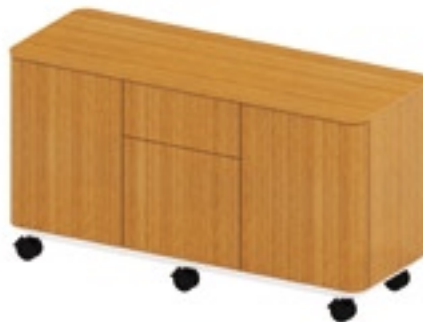
2 × hinged slab doors + 2 × drawers