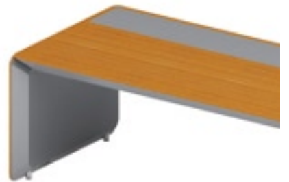
FS / SS Grey (RAL 7012) *

* An optional inlay made of hardened glass showed in the photo.