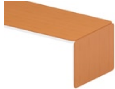
LH Beech Honey