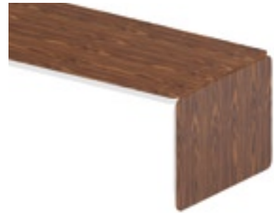
OA American Nut