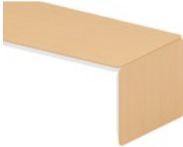
LN Beech Natur