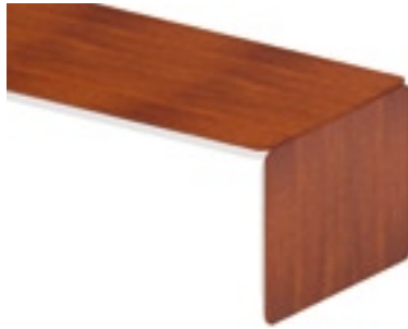
LK Classic Cherry