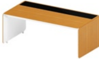
DESKTOP WITH GLASS INLAY