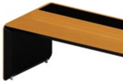
FG / SG Black (RAL 7021) *