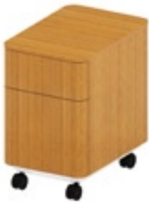
2 drawers + pencil drawer (see page 49)