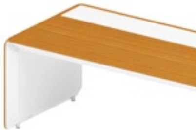
FI / SI White (RAL 9003) *