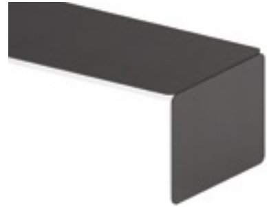
BG Beech Grey