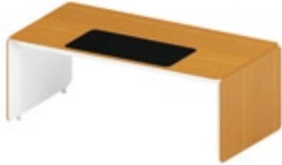
DESKTOP WITH LEATHER INLAY