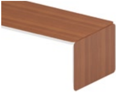
LV Beech Havana