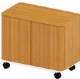
2 × hinged slab doors