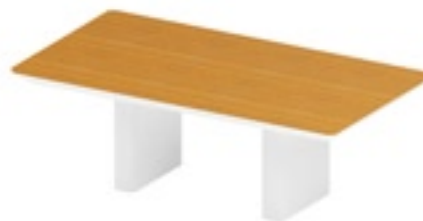
FREE-STANDING CONFERENCE TABLE